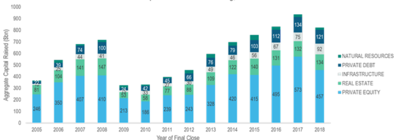
Private Capital Historical Fundraising, 2005 to 2018

With such elevated levels of interest in private equity, we thought it timely to refresh our thinking towards this alternative asset class. As firm believers in liquidity and transparency when dealing with our clients' portfolios, our natural inclination is to be cautious of any investment that does not meet these criteria – as such, it would be difficult for us to recommend investing in complex limited partnership structures.